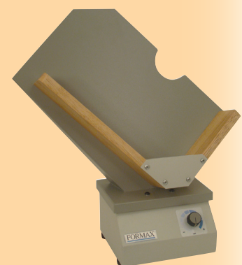
A 402 Series Jogger is a recommended option that reduces static electricity from forms and aligns them for proper feeding